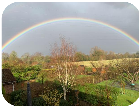
An amazing rainbow - Saturday 6 th Feb