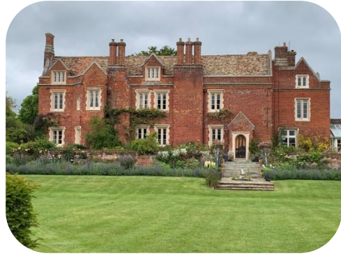
Childerley 6 th June