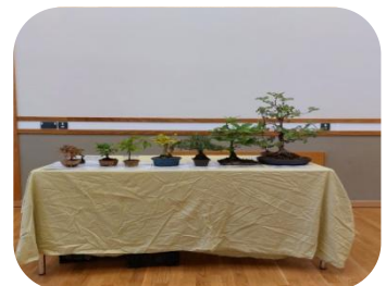
Venu's amazing bonsai>