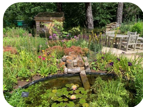
New natural planting