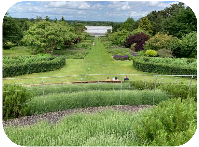
RHS Wisley 8 th June